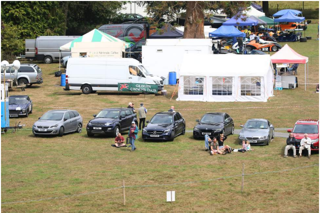
Disabled parking - front of Wiscombe House