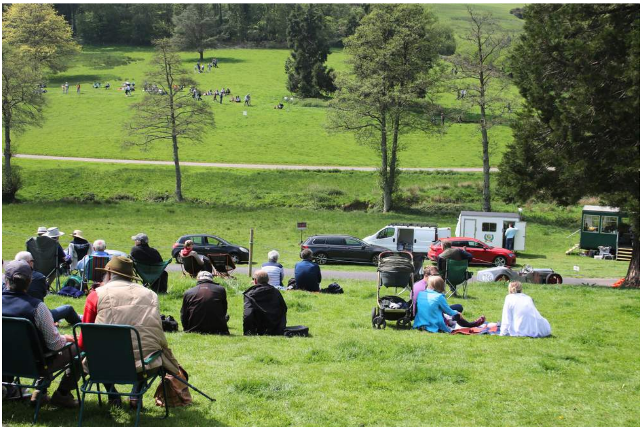
View across to Wis Straight