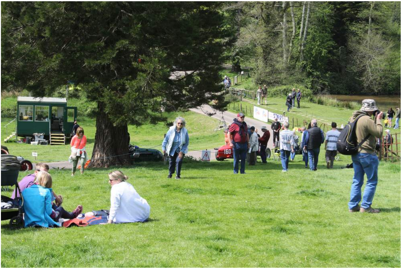
View down to the start line

To reserve disabled parking please send an e-mail to wiscombe.hillclimb@gmail.com